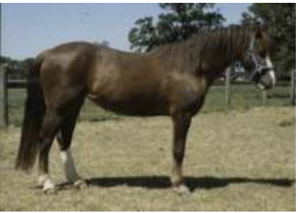
Figure 39. The same pony as in Figure 36 two months later, able to adopt a normal stance and on the way to a full recovery for ridden work. This pony went on to win County standard showing classes which is more a testament to the fallibility of judges than the quality of my surgery!

they often spring apart by up to an inch. The tendon ends send out new tendon fibres to bridge the gap: this can occur in about three months. This new tendon is juvenile and the horse should be rested for a year before putting strain on the new tendon. These cases need to be fitted with Eustace shoes with posterior extensions at the time of the operation. This is necessary to help foot placement on uneven bedding and prevent over-extension of the coffin joint. This style of shoeing will be necessary for three months during which time the animal should not be turned out loose. It can be walked out in hand on smooth ground. Free exercise is inadvisable for at least 6 months. Provided the deep digital flexor tendon is cut at the correct time, i.e. when contracture is noticed but before irreversible damage is done to