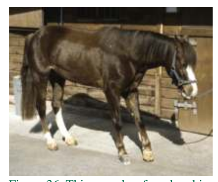
Figure 36. This pony has foundered in all four feet and is now at the old founder stage. Although superficially the pony appears to be adopting a classical laminitis stance with the forelegs stretched out in front; closer inspection shows the pony to be standing on its toes rather than its heels. This condition is due to excessive deep digital flexor tendon strain which can only be corrected by cutting the tendon (see Figs 37 & 39).

to malalignment of the pedal bone and the short pastern bone. Once this process starts it rarely stops. Mechanical release of tension on the deep flexor tendon can be obtained by raising the heels of the foot. However, this is not at all recommended in an acute founder or sinker case as even more compression is being placed on the coronary corium in the front of the foot and the pedal bone is likely to `slide down' the laminae and drastically worsen the founder. The alternative methods of treatment are to surgically cut the deep digital flexor tendon, cast the limb to the elbow or inject botulinum toxin into the deep digital flexor muscle. Surgery can provide instant relief in suitable cases and if done on sinker or acute founder cases can return them to normality (Fig. 37). The operation can be performed under local anaesthetic in the standing animal. With good technique the end result is cosmetically very acceptable (Fig. 38). Veterinary surgeons are