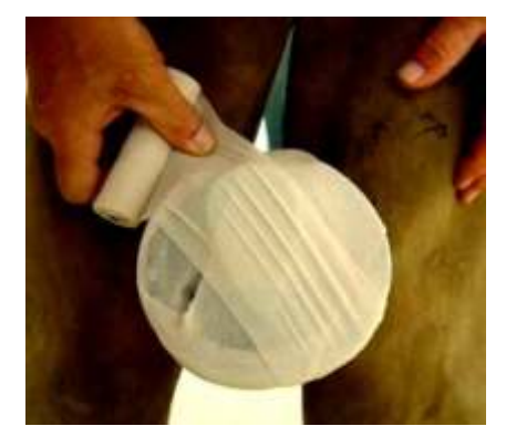
Fig 24. Sequence to show how to bandage on a TLC Frog Support using a figure of eight overlap technique.