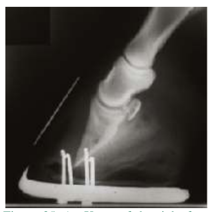
Figure 35. An X-ray of the right fore foot of the pony in Figure 36 at the old founder stage, see the black gas shadows under the wire marker. Notice how the pedal bone has become tilted out of alignment with the proximal phalanges by the pull of the deep digital flexor tendon. Incidentally, see how by leaving the nail heads proud of the fullering in the shoe this has tilted the shoe onto the heels. This is a bad practice not only in terms of laminitis but also relating to navicular syndrome.

In some cases of founder another complicating factor may start to operate. The muscle which works the deep digital flexor tendon starts to work overtime and contract. The reasons for this are unknown but may be related to the animal's individual pain threshold and the founder distance. As the muscle continues to contract the pedal bone is pulled away from the inside of the hoof wall (Figs. 35 & 36). This is painful to the animal as the laminal attachments are physically torn apart. The pull on the pedal bone forces it to tilt or rotate and results in pain in the coffin joint due