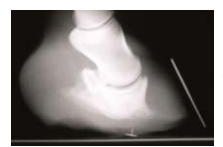
Figure 44. X-ray of chronic founder Type 2 foot. See how much of the pedal bone has disappeared (compare to Figure 43). The overgrown toe is a solid wedge of laminar horn right up to the coronary band. This horse was destroyed.

There is another type of case which develops the same type of foot distortion as in the chronic founder Type 1 yet is mortally affected; these cases I call a chronic founder Type 2. The essential difference between the two types is that the Type 1 animals can lead almost pain-free lives whilst the Type 2 cases remain severely lame from the time they founder. Type 2 cases only have a life expectancy of up to three years. That is three years as a cripple before someone finally puts them down on humane grounds. There may be intermittent periods of relative improvement in the level of lameness. The periods of most severe lameness are associated with the build up of serum pockets which may then progress to form abscesses. These are usually under the sole around the tip of the pedal bone and will erupt periodically