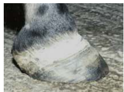
Figure 40. A chronic founder Type 1 foot. This foot would look longer with a concave front wall rather than a convex one if someone had not nibbled at the toe with a rasp. The most recently produced horn, about the top inch, just below the coronary band is at a much more upright angle than the rest of the front wall. If this line is extended to the ground removing all the horn in front, the remaining wall will be within 2 degrees of parallelism to the front of the bone inside (see Fig. 41).

The aim of foot treatment in the chronic founder case is to restore the relationship between the phalangeal bones, the hoof and the ground to as near normality as possible. We have seen that chronic founder cases tend to produce an excess of laminar horn around the front part of their feet and grow their heels faster than their toes. This tends to force the pedal bone into an ever more tilted or 'rotated' position. The farrier must compensate for this by removing rather more heel than toe; the exact amount can be judged by looking at the relative widths of the growth rings. Most importantly, the front wall must be rasped back to keep it parallel with the front of the pedal bone inside. This often means in neglected or long standing cases that the front wall proper, the tubular