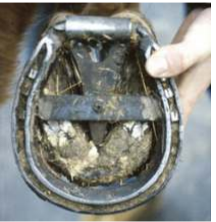
Figure 27. An all steel adjustable heart bar shoe. The heart bar is hinged at the base. The shoe is fitted with no pressure on the heart bar. Frog support is increased after nailing on by turning the grub screw (near the centre of the foot) with an Allen key.

Figure 28. The plastic and steel glue-on adjustable heart bar shoe (Eustace shoe) developed at the Laminitis Clinic. The shoe is adjusted in the same way as that in Figure 27 but is attached to the foot by means of glue rather than nails. Shoeing with this device has proven to be less traumatic to both the horse and the farrier!