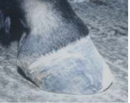
Figure 41. Same foot as in previous figure 10 minutes later. Rasping back the toe has exposed a crescent of the abnormal whitish laminar horn so characteristic of chronic founder cases. This animal was much more comfortable after this foot dressing, it must be like having a pair of clogs replaced by running shoes!

five degrees depending on the breed) to the ground. It is sometimes not easy for the farrier to be sure how much of the front wall must be rasped away to restore parallelism with the front of the pedal bone. An excellent guide is to look at the foot from the side and study the angulation of the most recent horn, just below the coronary band at the front (Fig. 40). If this line is extended to the ground and all the horn in front is rasped away the remaining wall will be within two degrees of parallelism with the front of the pedal bone inside (Fig. 41). The farrier should ask for an X-ray to be taken if he is not sure how much to rasp back. Farriers refer to this rasping of the front wall of the foot as 'dressing the foot forwards'. If no X-rays are available for a chronic founder case the farrier is safe to keep dressing the foot forwards and pressing onto what remains of the dorsal hoof wall. When it starts to yield, that is the time to put the rasp away.