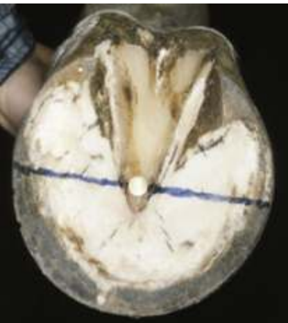
Figure 20. Prior to taking an X-ray, the frog is trimmed and a drawing pin with a shortened point is placed about 1 cm back from the point of frog. The position of the pin is marked by drawing a line across the frog and sole.

For prognostic purposes when X-raying laminitis, acute founder and sinker cases, another marker is used on the front of the hoof wall. This time a straight stiff wire with square ends and of known length (about 40 mm long) is used to highlight the front and top of the hoof wall. It is important to know the length of the wire so that the effects of magnification in taking the X-ray can be allowed for. Firstly the top of the hoof wall just below the coronary band is lightly rasped to remove flaking or excessive perioplic horn. The top of the wall in the midline is gently pushed with your finger and the top of the wire marker taped to the wall with the top of the wire where the wall starts to yield into softer perioplic horn (Fig 21). The position where the top of the wire was placed may be marked with an indelible pen. The horse should ideally stand with one foot on the block with the cannon bone vertical. this doesn't happen very often in practice so we