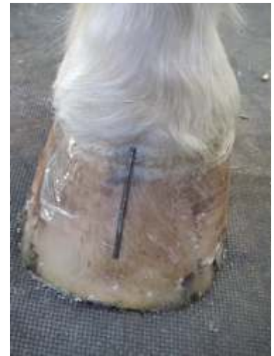
Figure 21. In addition to the pin marker a piece of straight stiff wire about 40 mm long is taped to the front of the wall of the foot. THE TOP OF THE WIRE IS PLACED WHERE THE HORN CHANGES FROM HARD TO SOFT. It is sometimes necessary to lightly rasp the wall to smooth the horn before fitting the wire marker.

A few simple preliminaries will make the difference between an X-ray that is some use for diagnostic and prognostic purposes and one which is not. A wooden block is needed about 3 inches high and wide enough for the horse to stand on. A piece of the vicar's bicycle spoke is embedded into the top of the wooden block to highlight the ground line. The horse's foot is picked and brushed out and any flaking horn or shaggy frog trimmed away. It is important to trim the frog so that the collateral sulci can be seen to their depths on both sides of the frog which are then beveled. The frog does not show up well on lateral X-rays, in order to show the frog in relation to the pedal bone inside, a marker (usually a drawing pin) is used to highlight the frog. The pin is pushed into the front inch of the frog. It does not matter exactly where the pin is placed as long as its position on the frog is marked in some way. I prefer to draw a felt tipped pen line right across the sole and