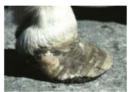
Figure 42. An old Sheltand pony's foot, an example of chronic founder Type 1

through the sole or by migration up the wall and out of the coronary band. The serum pockets form because there is an abnormal and permanently distorted circulation in the foot. In addition the pedal bone to some extent rests on the inside of the horny sole because there is insufficient support from the laminae. This leads to chronic bruising of the sole with intermittent formation of serum pockets or abscesses. The pedal bone itself is much smaller than normal and the 'tip' looks ragged on X-ray (Fig. 44). This is because when the pedal bone is not subject to the normal suspending pull from the laminal attachments it is absorbed into the blood stream; this is known as absolute disuse atrophy. Another reason for part of the pedal bone to disappear is because it is being pressed onto the inside of the horny sole; this is known as pressure atrophy (Figs. 45 & 46). In some cases there may be osteomyelitis or pus-like infection of the bone itself. This is extremly painful for the horse and a very difficult complication to try and treat. The discharge from osteomyelitis cases has a particular and violent odour.