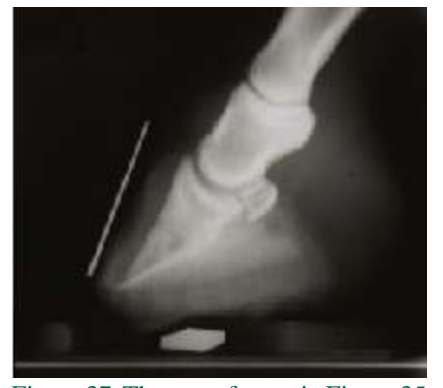
Figure 37. The same foot as in Figure 35 six days later, the deep digital flexor tendon has been cut in the interim. The phalanges are all back in alignment, the heels of the foot have been lowered to set the angle of the pedal bone correctly in relation to the ground. A dorsal wall resection has also been performed and a Eustace shoe fitted.

to malalignment of the pedal bone and the short pastern bone. Once this process starts it rarely stops. Mechanical release of tension on the deep flexor tendon can be obtained by raising the heels of the foot. However, this is not at all recommended in an acute founder or sinker case as even more compression is being placed on the coronary corium in the front of the foot and the pedal bone is likely to `slide down' the laminae and drastically worsen the founder. The alternative methods of treatment are to surgically cut the deep digital flexor tendon, cast the limb to the elbow or inject botulinum toxin into the deep digital flexor muscle. Surgery can provide instant relief in suitable cases and if done on sinker or acute founder cases can return them to normality (Fig. 37). The operation can be performed under local anaesthetic in the standing animal. With good technique the end result is cosmetically very acceptable (Fig. 38). Veterinary surgeons are