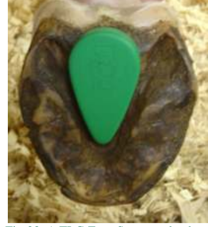
Fig 23. A TLC Frog Support glued to the foot for demonstration purposes

hooves. They are easy to fit and available from Equi Life Ltd and most good tack shops, farriers and veterinary surgeons.