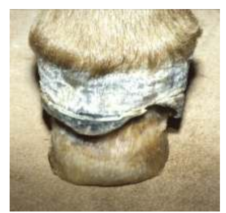
Figure 33. Similarly to the situation of the cob in Figure 32, when the old hoof capsule becomes so detached from underlying corium and new horn that it moves largely independently, the animal is often more comfortable if it is removed. This allows the new horn to grow closely down around the pedal bone instead of being pulled away at every stride. This is the same animal as in Fig. 8, the pedal bone had penetrated the sole in this foot and in the other feet which were treated similarly.