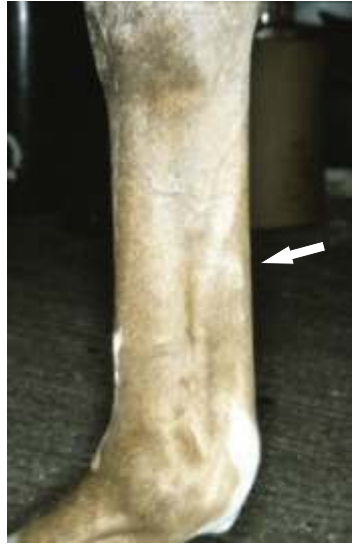
Figure 38. The arrow highlights the site where a standing deep digital flexor tenotomy was performed on this mare 12 months previously.